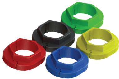
Multiple colors for Identification