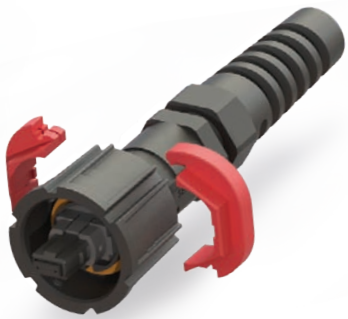
Retro Fit Safe Lock Add Safe Lock ring as needed in field