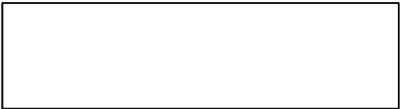
① Этикетка с наименованием сборки