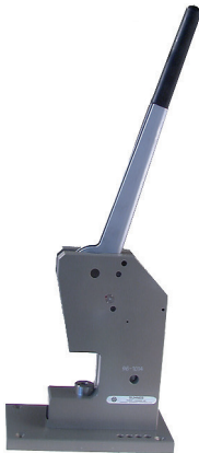
Table press with interchangeable inserts