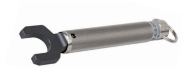
Torque wrench (standard style)