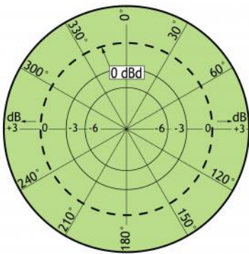
TYPICAL RADIATION PATTERN (H-PLANE)