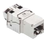
Cat. 6A EL/s R813508