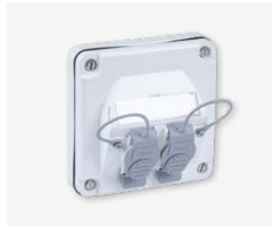
UP DA-Outlet IP67