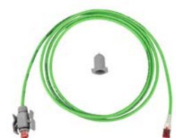
Patch Cord Cat. 6A, S/FTP, 4P, PUR, 2.5m grün R313637