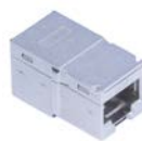
Coupler RJ45/s Cat. 6A R848272