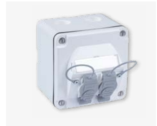
AP DA-Outlet IP67