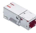
Cat. 6A ISO/s R803927