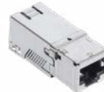
Cat. 8 R847825