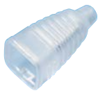
Splash Sleeve IP54, transparent R306064