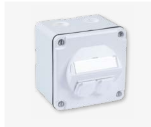
AP DA-Outlet IP54