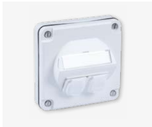
UP DA-Outlet IP54