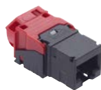
Cat. 6A EL/u R813510