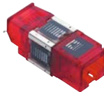
Cat. 6A ISO/u R803926